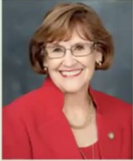
Sen. Gayle Harrell