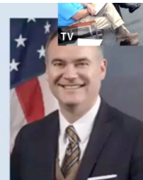
Rep. Wyman Duggan