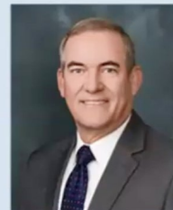
Sen. Stan McClain

Allows applicants to use mitigation bank credits from outside the area when local credits aren't available; also would allow mitigation credits to be issued and sold before wetlands restoration takes place.